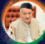
Shri Bhagat Singh Koshyari Formal Governor of Maharashtra