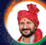
Hon'ble Neeraj Kumar Singh Bablu Minister of Public Health Engineering Govt. of Bihar