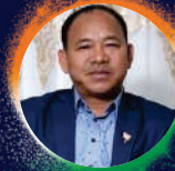
Hon'ble Mama Natung Minister of Sports and Youth Affairs of Arunachal Pradesh