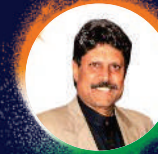
Kapil Dev Indian Former Cricketer