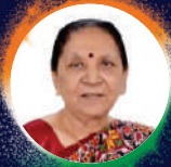
Hon'ble Anandiben Patel Governor of Uttar Pradesh