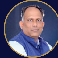
AIB Group of Companies Managing Director- Sunitha Infrastructures Pvt. Ltd., Hyderabad, Telangana